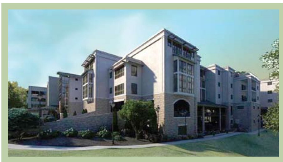
Latest architect’s rendering of the new medical center at Rydal Park, which is planned to be complete by fall 2011.